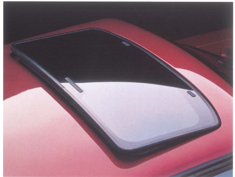
The hatchback's flip-up open-air roof option lets the outside in with one quick flip.