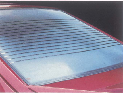
The rear window defroster is a popular and practical option.

A glance down Mustang's standard equipment list can be an enlightening exercise. There's much to like. In fact, reconciling the feature content with Mustang's price may give rise to some very pleasant deliberation. Full instrumentation (including tachometer and gauge cluster), dual remote-control mirrors, an array of convenience lights, tinted glass, interval wipers, electronic AM/FM stereo seek radio and more. It seems there's a lot here for the money, and there is. It's called value. And Mustang Preferred Equipment Packages, detailed at right, offer you even more with special discounts on option groups compared to individual items purchased separately.