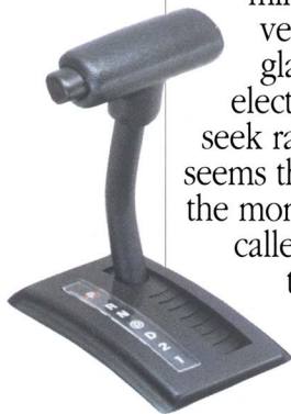
For those who prefer a less active style of motoring, both of the Mustang engines can be teamed with the optional automatic overdrive transmission.

A glance down Mustang's standard equipment list can be an enlightening exercise. There's much to like. In fact, reconciling the feature content with Mustang's price may give rise to some very pleasant deliberation. Full instrumentation (including tachometer and gauge cluster), dual remote-control mirrors, an array of convenience lights, tinted glass, interval wipers, electronic AM/FM stereo seek radio and more. It seems there's a lot here for the money, and there is. It's called value. And Mustang Preferred Equipment Packages, detailed at right, offer you even more with special discounts on option groups compared to individual items purchased separately.