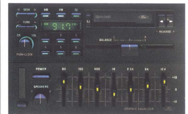
The optional 7-band graphic equalizer fine tunes specific frequency ranges.