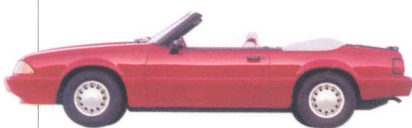
Mustang LX Convertible