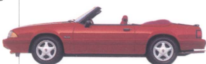
Mustang LX 5.0L Convertible