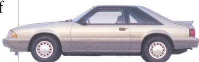
Mustang LX 2-Door Hatchback