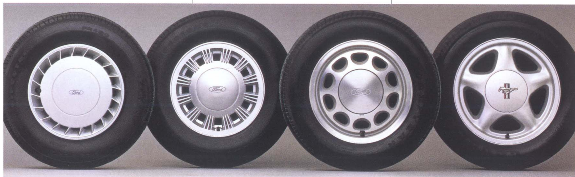
Left to right: finned wheel cover; styled road wheel; cast aluminum wheel; 5-spoke cast aluminum wheel.