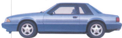
Mustang LX 5.0L 2-Door Sedan