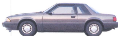
Mustang LX 2-Door Sedan

formance. You can also pick the type of body style that suits you best. Mustang is available as a 2-door hatchback. It's also available as a 2-door sedan (except GT). Or as a classic convertible. In all, there are eight different expressions of the legendary Mustang spirit.